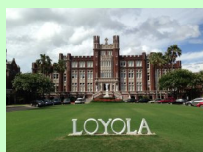
New Orleans Landmark